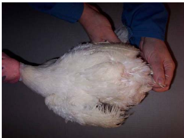
Example of scoring system for integument of hens. This photo indicates scoring scale 3 of back of white hen.

The intention was that this system should be easy to use by scorers of different background e.g. scientists, welfare inspectors, administrators, breeders and producer organisations. It should provide a good general picture for the documentation of the status of integument